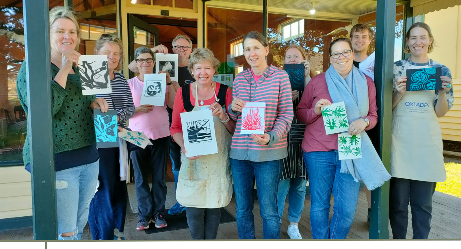
Image Credit: Printmaking Workshop led by 2021 Activating Collections Artist In Residence Emilie Monty at the Mount Barker Co-Op. Photography by Emilie Monty.