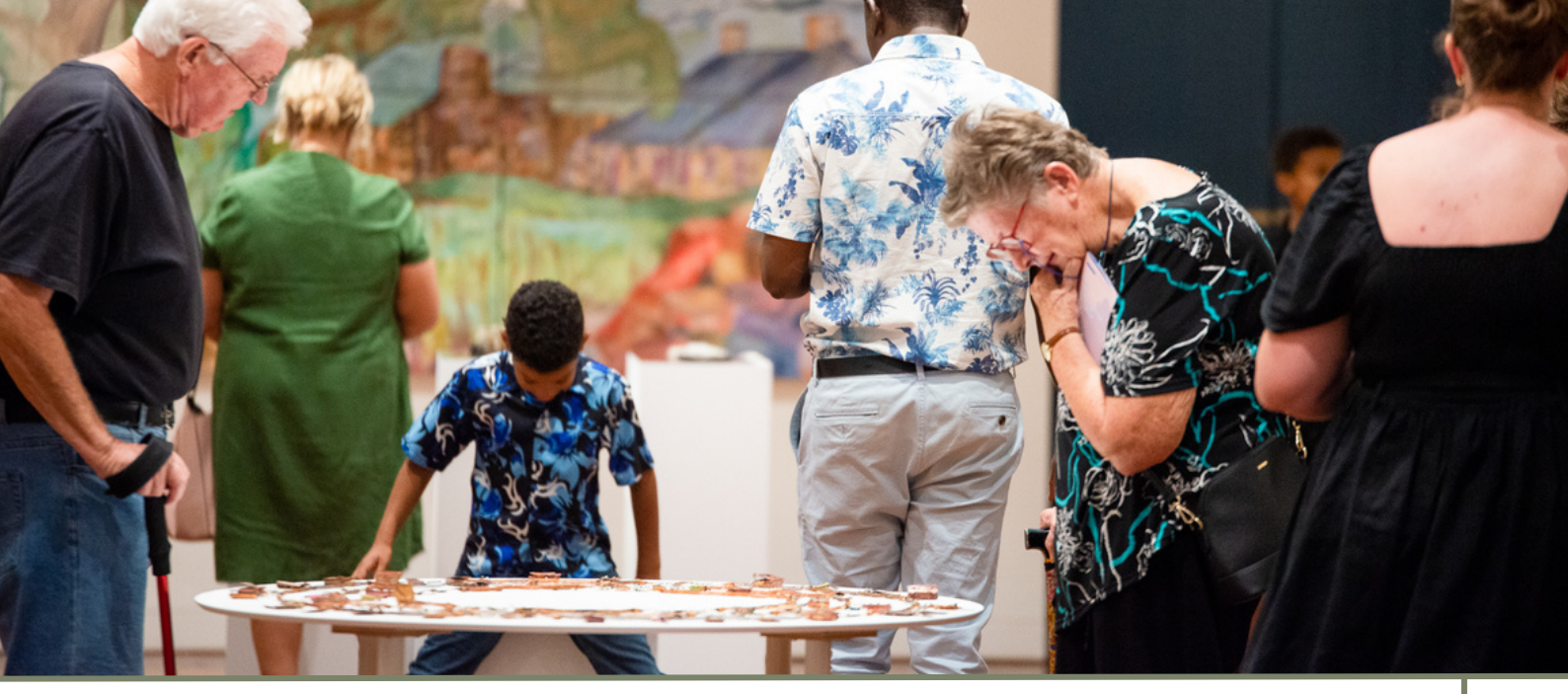
The Alternative Archive opening.